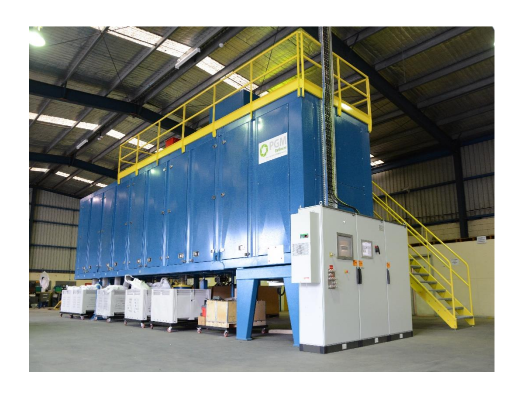
Blubox e-waste recycling unit