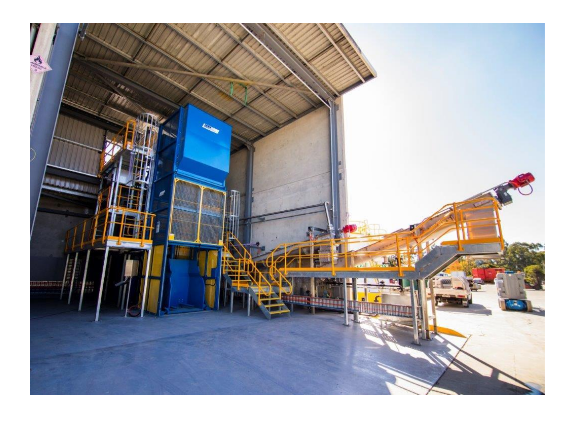
Hazpak paint de-packaging unit