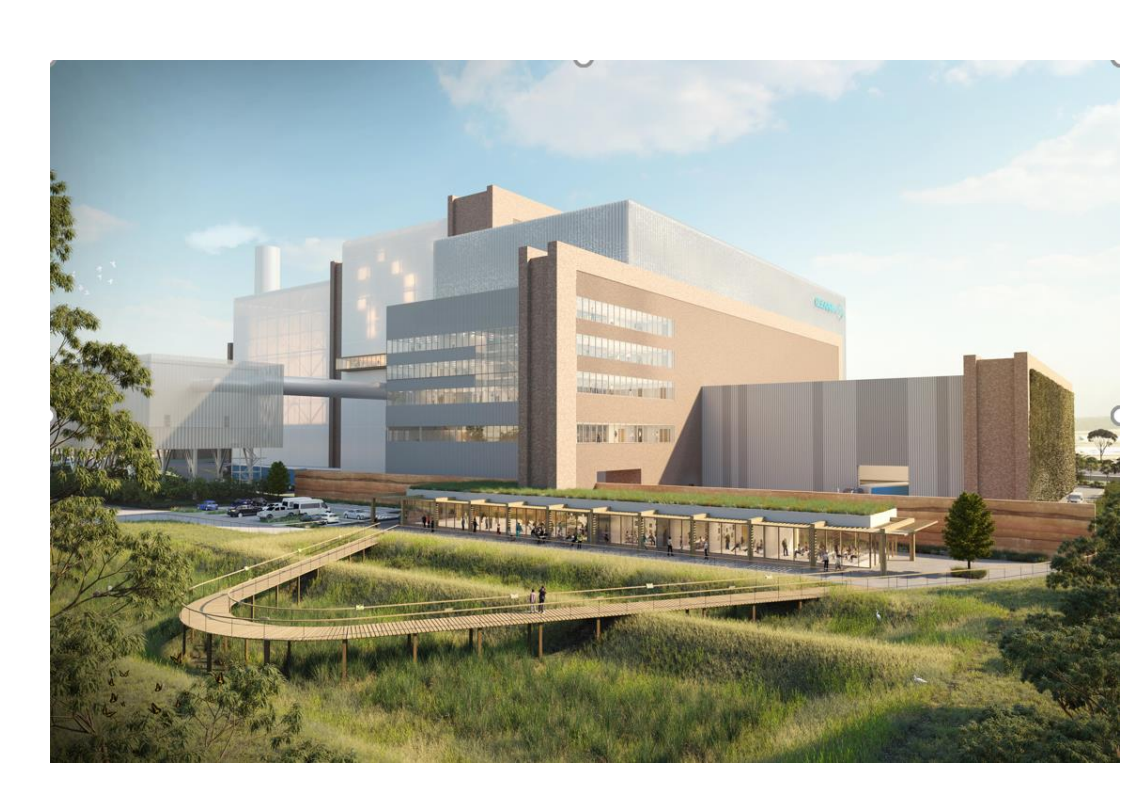
Eastern Creek W2E